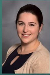
Tyler Dranguet Senator