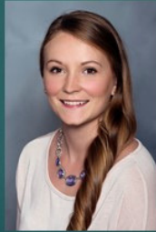
Dana Mints Senator